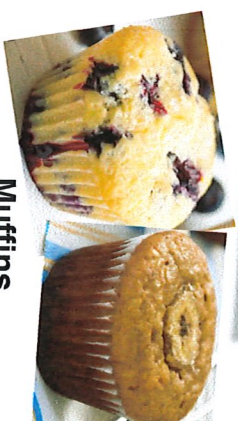
Muffins Blueberry or Banana