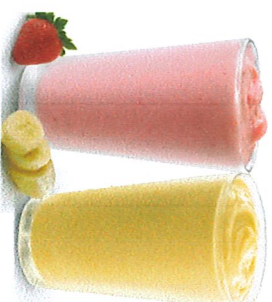
Smoothies Strawberry and Banana or Mango and Pineapple