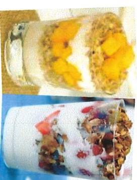
Fruit Parfait Mango or Berry